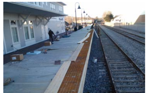
Brunswick Station's 400-ft high-level platform is in place.

Construction on the Downeaster Expansion Project continues. During the 2011 construction season, 30 grade crossings were rehabilitated, more than 12,000 ties were replaced, 9 culverts were rebuilt and 297 track segments were welded. Drainage and double track work at Brunswick station is complete, and the concrete portions of the passenger platforms in Brunswick and Freeport are complete. Winter work will continue on signal systems and on the construction of a freight siding in Brunswick. Service to Freeport and Brunswick is currently on target to begin in the fall of 2012.