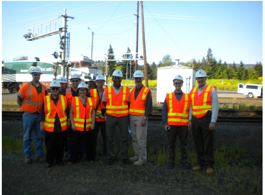
Work crew at Kelso Martin's Bluff, Washington