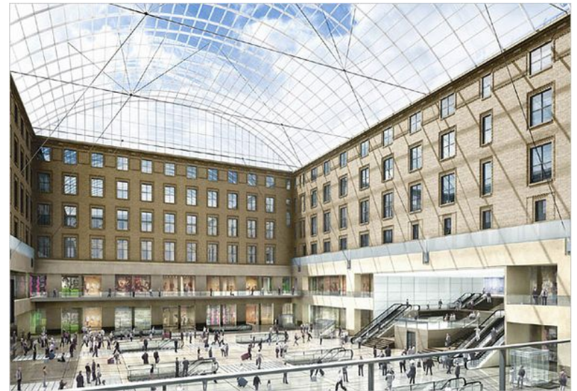
Rendering of Moynihan Station (TIGER)